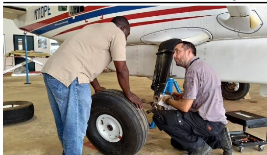
Training our future Liberian engineer.