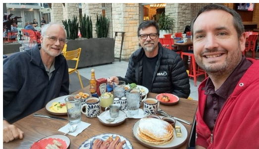
Breakfast in the States with MAF colleagues.

There's no way to deny the challenges we're facing right now, but we continue to see God's goodness in both the small and large details of our lives here. We are always blown away by the stories we hear, facilitated by the work of MAF in Liberia: children who can receive an education, patients who can receive medicine, the hopeless hearing about the love of Jesus.