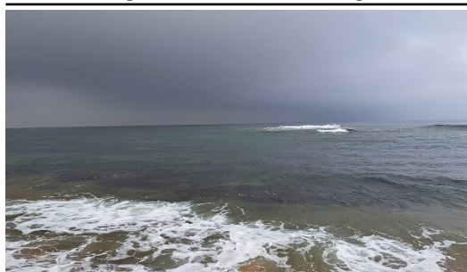
Stormy skies in Liberia's rainy season.