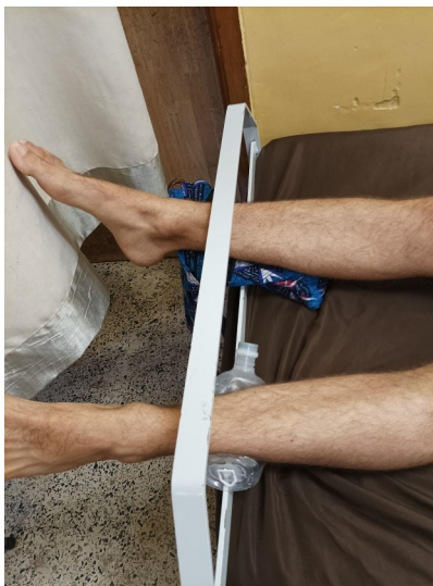
The perils of being too tall—custom bed extension with an empty IV bottle and a bag.

Dave is back at home now, and recovering from his experience! He'll have a good scar as a souvenir from his stay in hospital, and it'll be a few weeks until he's back up to full strength.