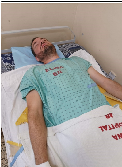
Post surgery, in the hospital room we'd call home for two nights.