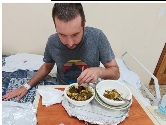
Hospital food—Liberian style. Spicy chicken and cassava greens. They don't really do 'mild'.