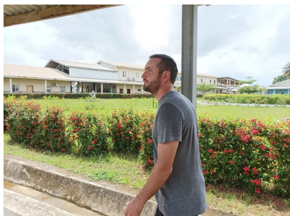
A gentle stroll in the hospital garden, featuring a memorial for those who lost their lives to Ebola.