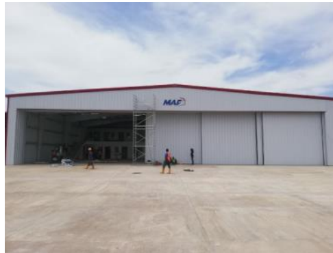
MAF's shiny new hangar in Liberia

Thank you, and thank you again for partnering with us and with MAF.