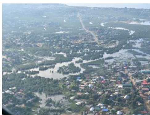
The wet world of Liberia, from the air.