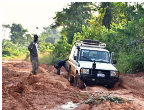
Liberia's rainy season roads